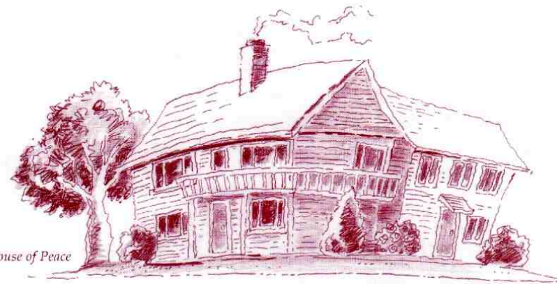
House of Peace

Feel free to use anything from this publication to glorify God and advance His Kingdom.