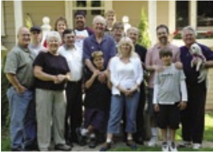
YWAM Associates International Board Meeting, Deroche, BC May 14, 2004